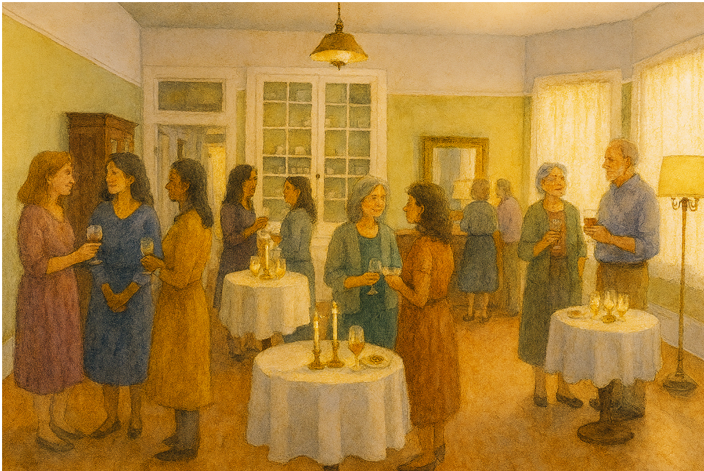
Rendering of a private event inside the house