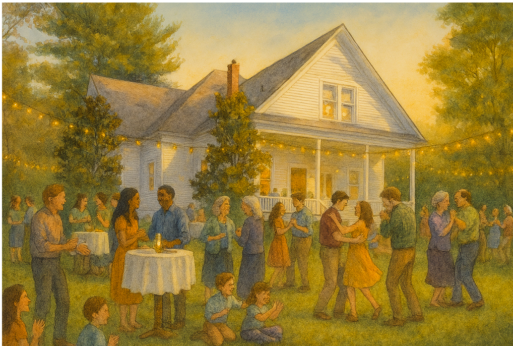
Rendering of a community gathering in the garden park