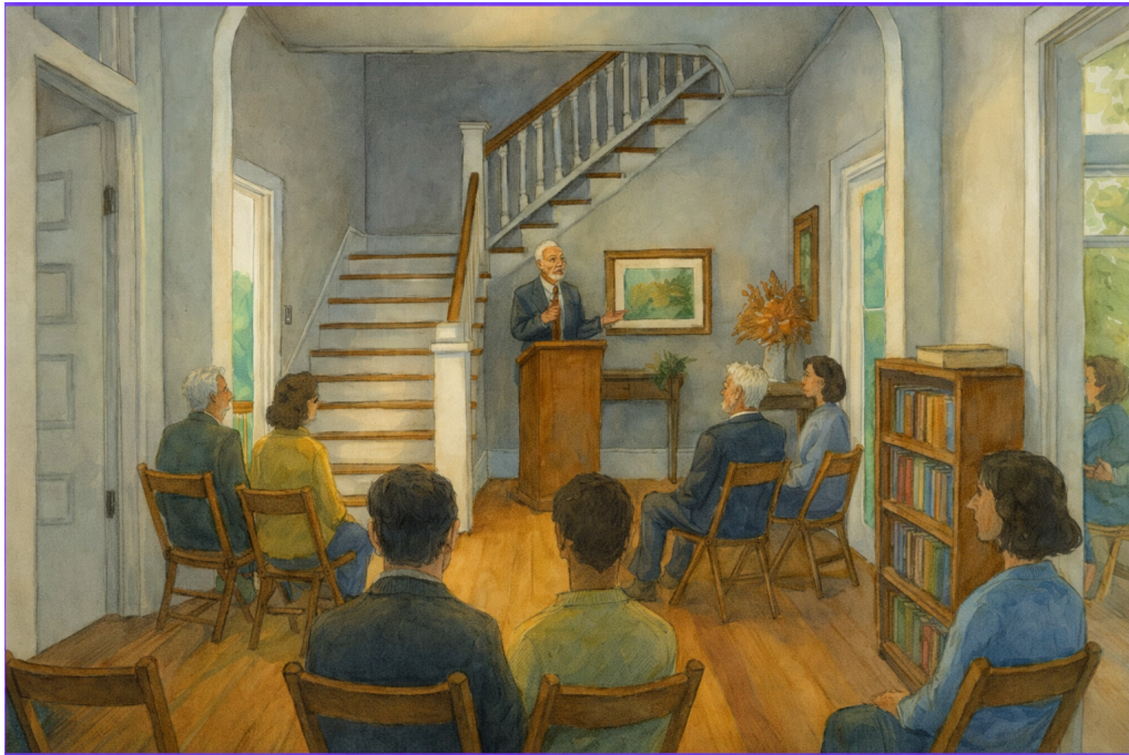
Rendering of a public meeting inside the house