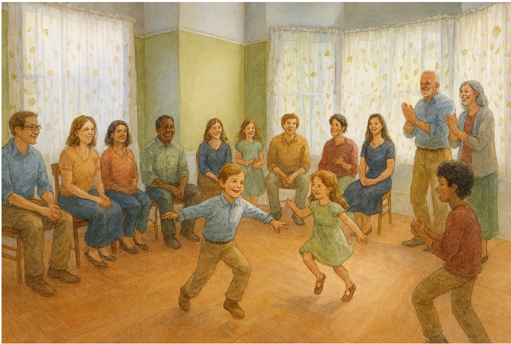
Rendering of a community gathering inside the house